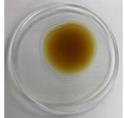
Product of Vermont USA